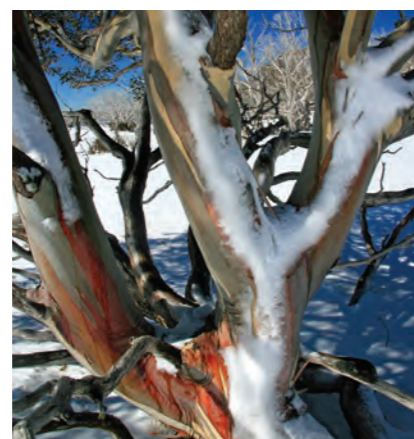
MOUNT HOTHAM'S SNOWFALL IS AMONG THE HIGHEST IN AUSTRALIA.