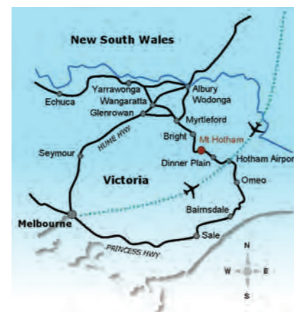
HOTHAM AIRPORT IS ONLY 20 MINUTES FROM THE RESORT VILLAGE.