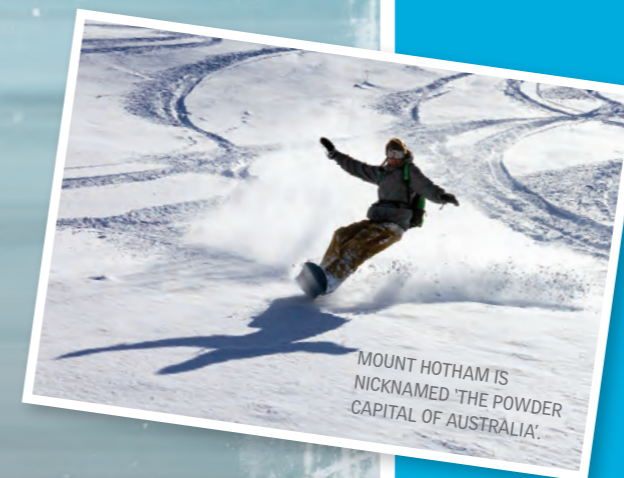
MOUNT HOTHAM IS NICKNAMED 'THE POWDER CAPITAL OF AUSTRALIA'.