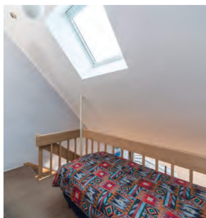
WITH A 4.5 STAR WERS WINTER RATING, VELUX SKYLIGHTS KEEP THE HEAT INSIDE.