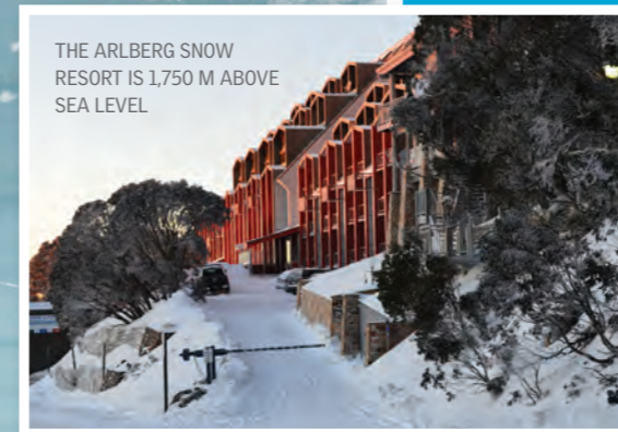
THE ARLBERG SNOW RESORT IS 1,750 M ABOVE SEA LEVEL

"Natural weather patterns are part of the beauty and mystique of the mountain. One moment you're skiing in a t-shirt, the next it's minus 5° C and you're in the middle of a snowstorm. Mount Hotham is not for the faint-hearted."